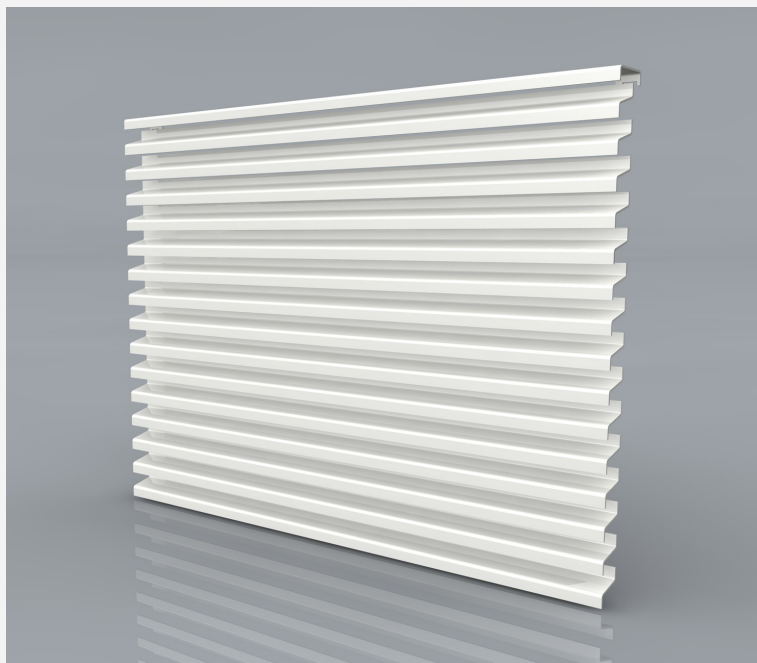
pictured: aluminum louver

FlowGrill louvers are developed for extreme circumstances and available in different designs, many functional executions and additional options.